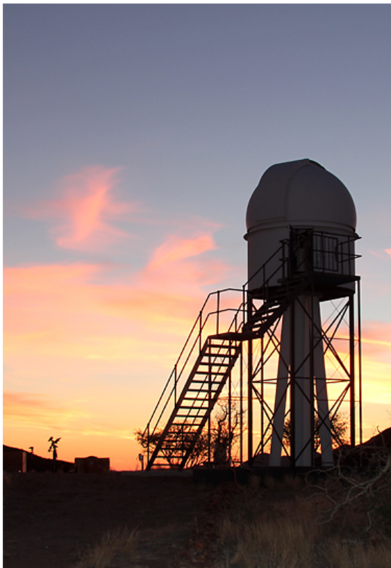
The Rooisand 3.2 m dome