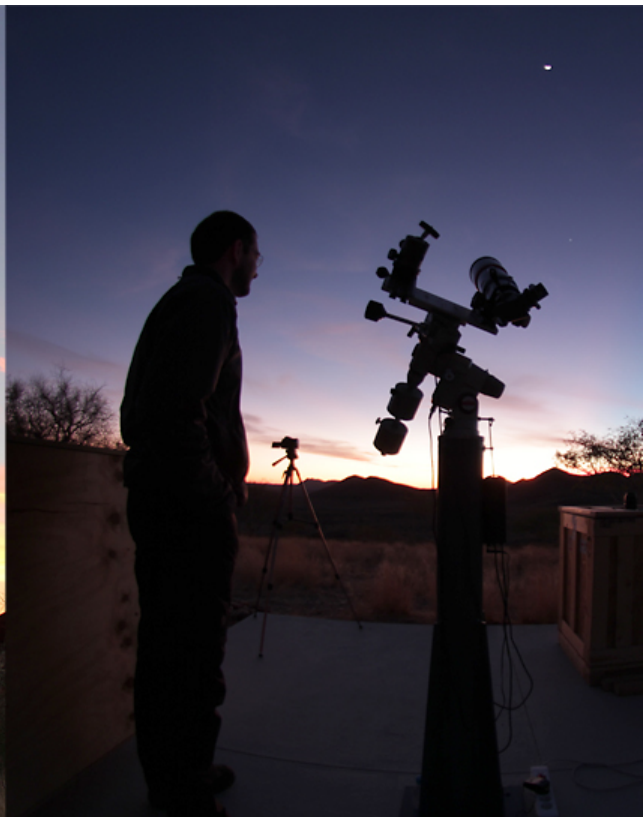
Vixen mount for wide angle photography